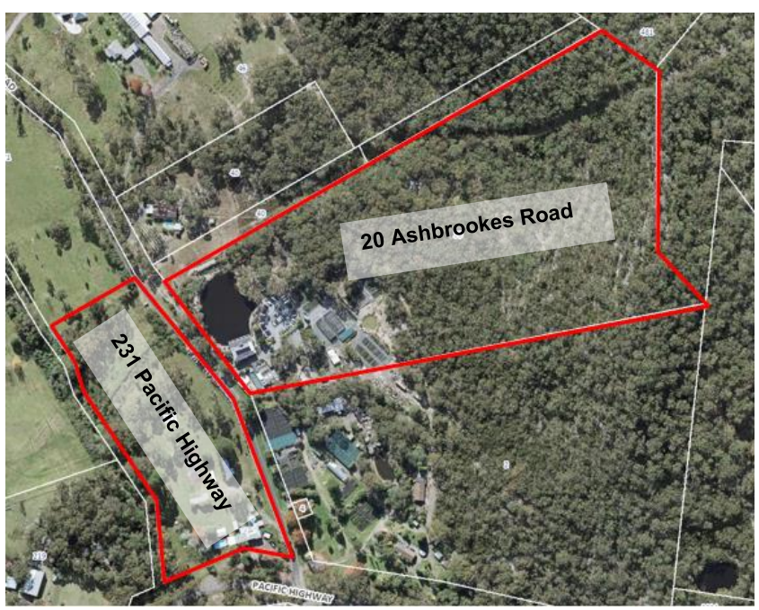
Figure 2: Site map

Both allotments are zoned RU1 Primary Production and the eastern portion of Lot 1 DP 547622 is zoned C2 Environmental Conservation (no development is proposed within the C2 zone).