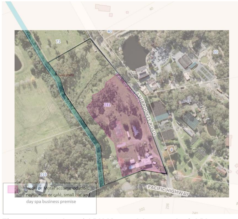
Figure 2 – Overlay of APU Mapped Area on Aerial Photography – 231 Pacific Highway Note: this is an older aerial photograph and all former structures have been demolished.

The land subject to the additional permitted uses and forming part of the development application is largely cleared and disturbed land on the eastern part of the property, including a former tennis court and other ancillary structures shown on the aerial photograph overlay below.