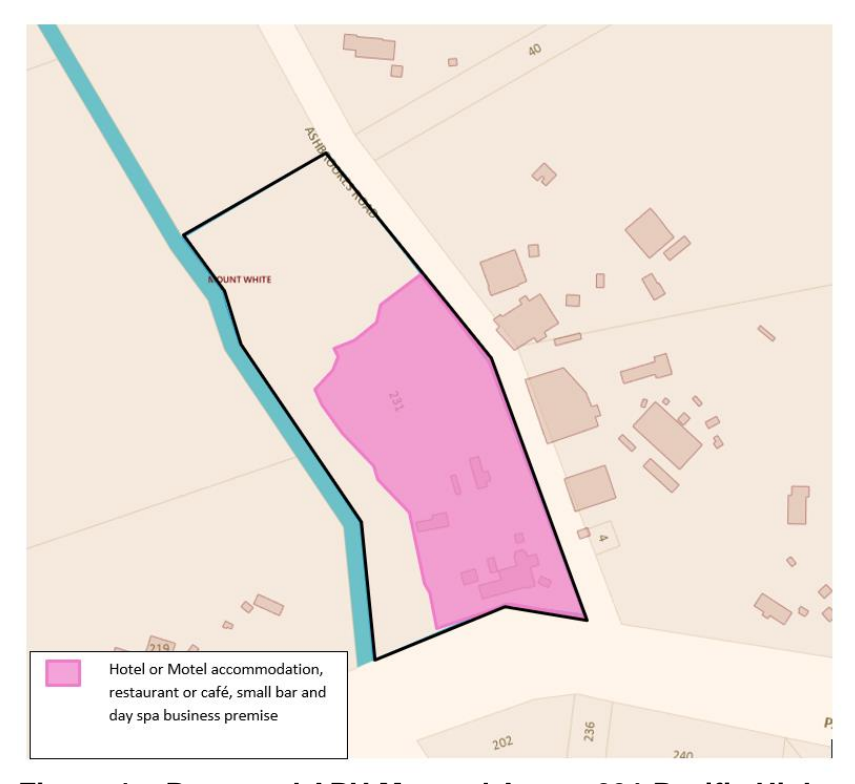
Figure 1 - Proposed APU Mapped Area - 231 Pacific Highway

The Planning Proposal seeks to include additional permitted uses for the site, within the mapped area located on the south-eastern part of the property, along the Ashbrookes Road and Pacific Highway frontages, and excluding the riparian zone to Calverts Creek and the northern part of the land. The mapped additional permitted use (APU) area in the Planning Proposal is shown below: