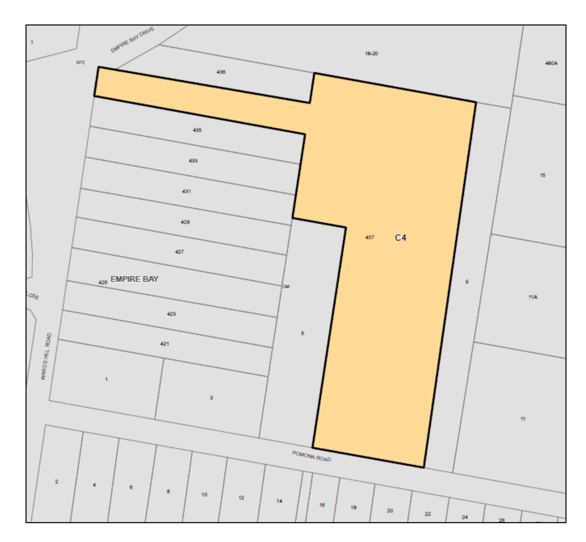
Figure 3 - Proposed Environmental Living Zone under CCLEP