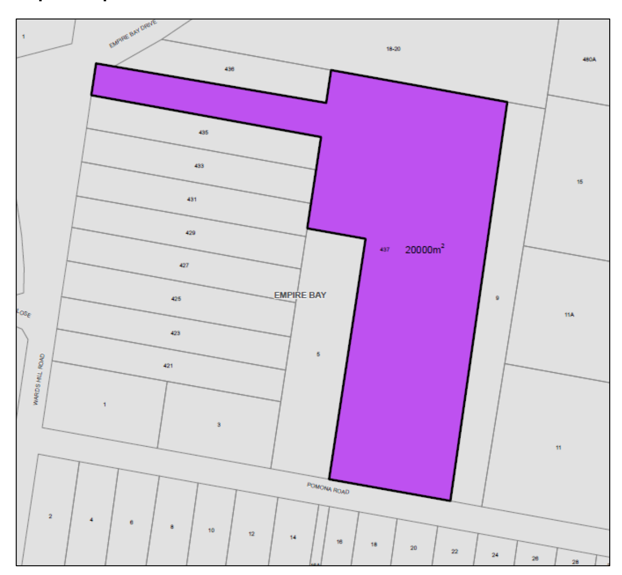
Figure 11 – Proposed Minimum Lot Size under CCLEP