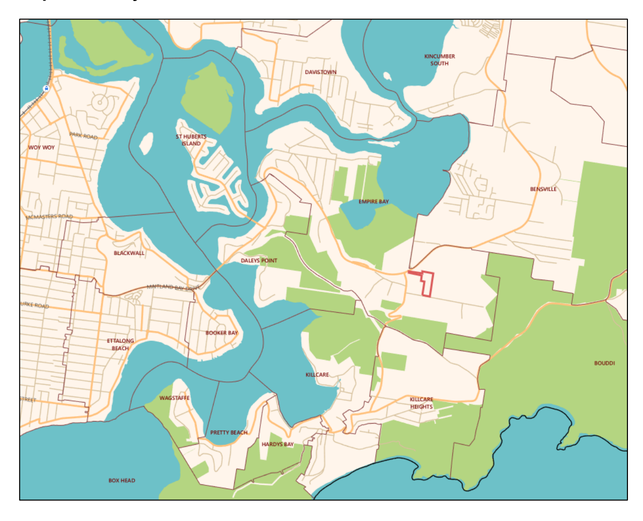
Figure 7 – Subject land to be rezoned shown in context of broader locality