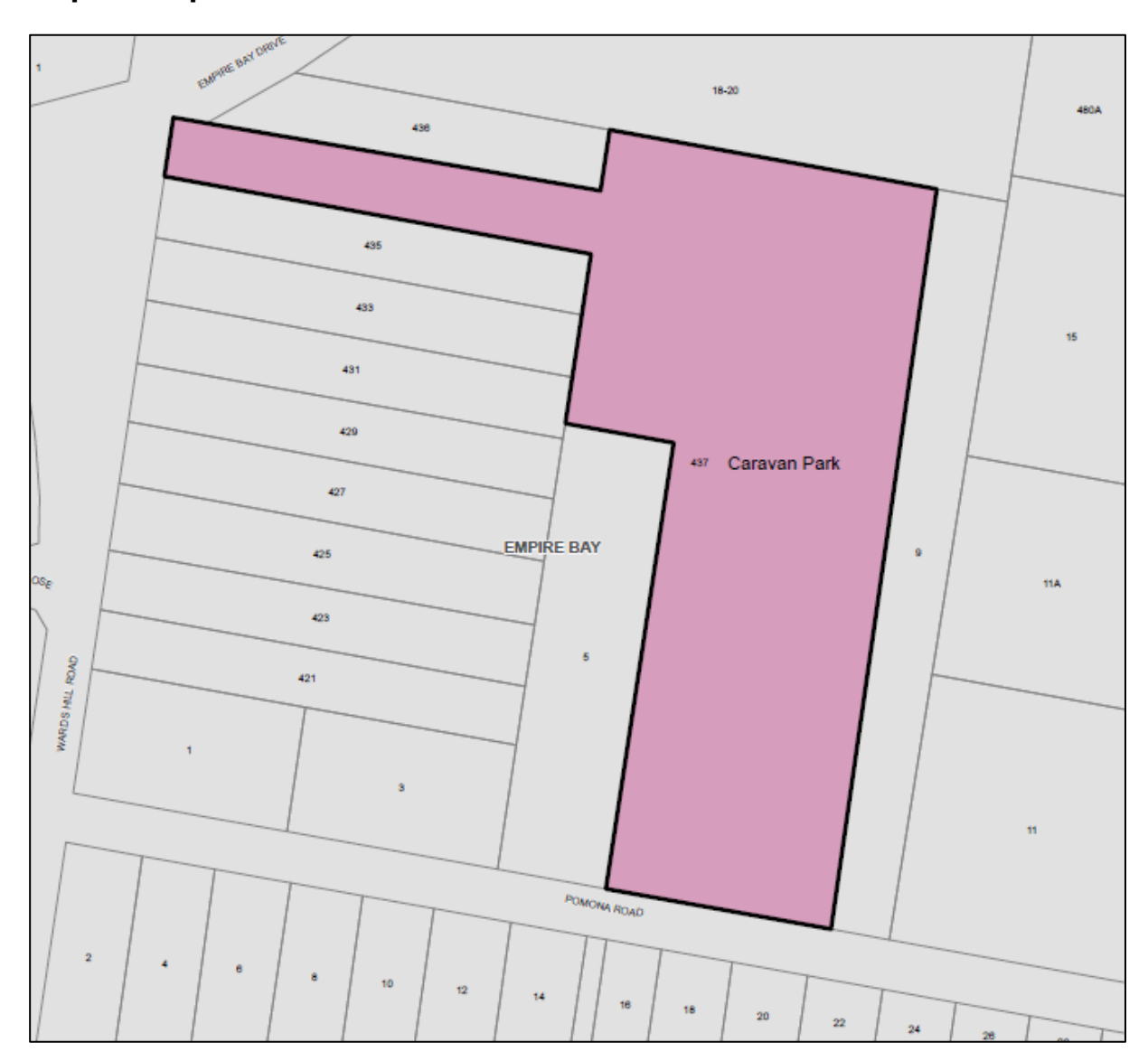
Figure 12 – Proposed Additional Permitted Use under CCLEP