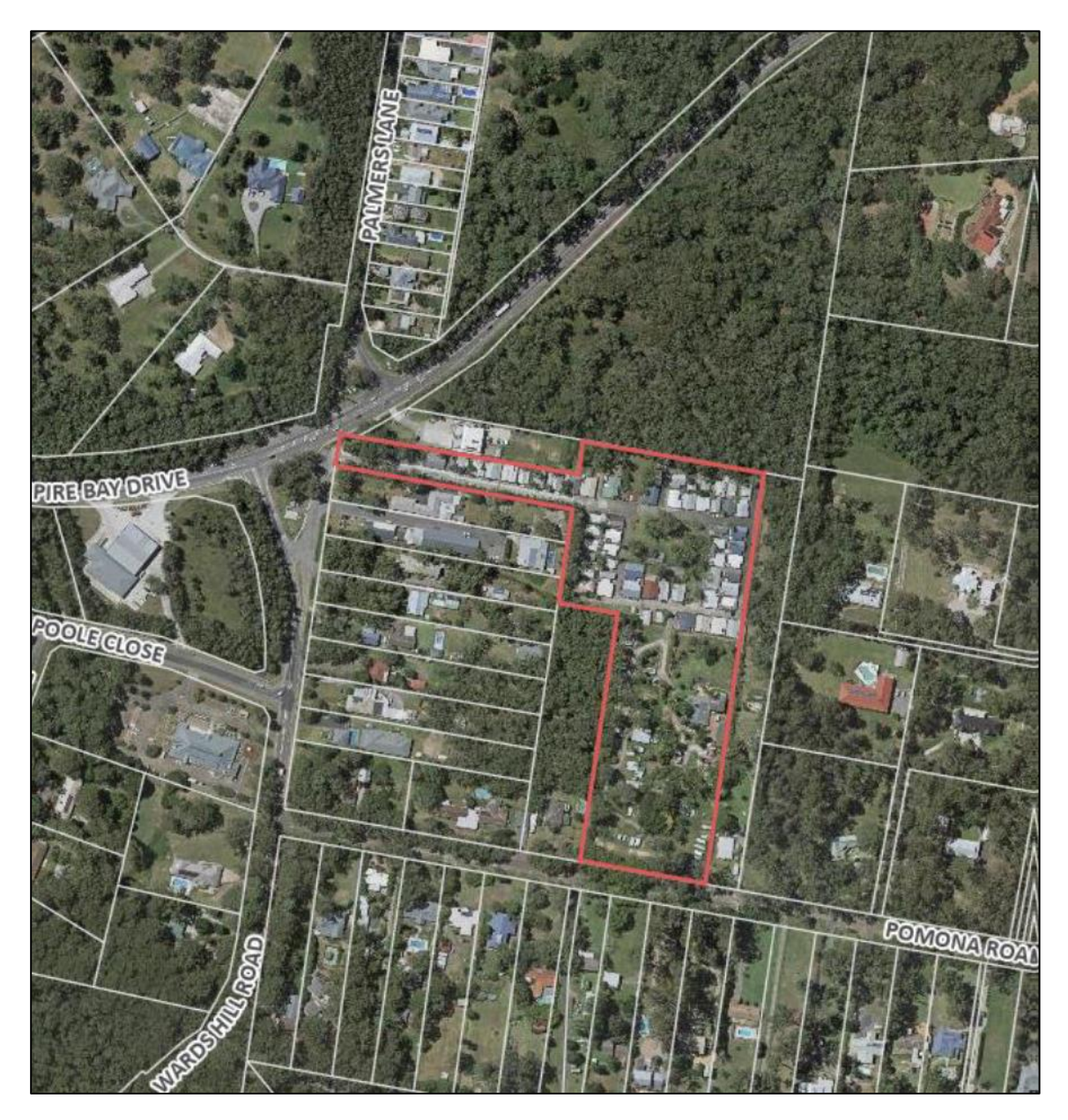
Figure 8 – Aerial Photograph of land proposed to be rezoned