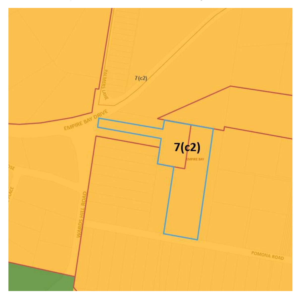
Figure 2 – Existing Zoning under IDO 122

The land is zoned 7(c2) Conservation and Scenic Protection (Scenic Protection – Rural Small Holdings) under Interim Development Order No 122 – Gosford (IDO 122) (Figure 2).