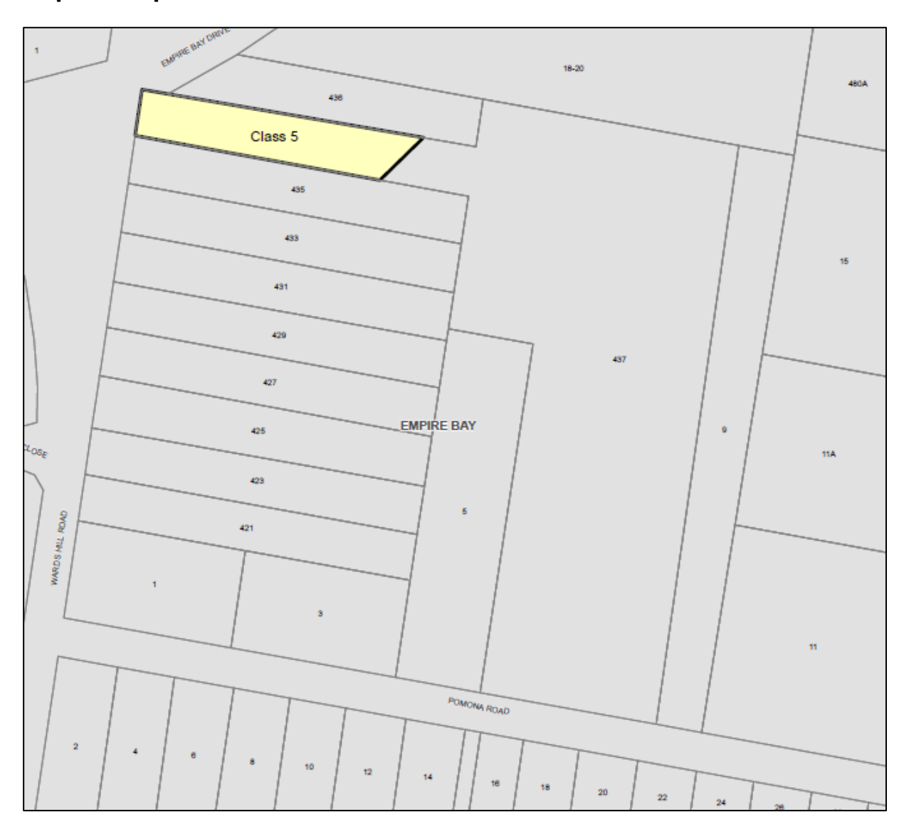
Figure 13 – Proposed Acid Sulfate Soil under CCLEP