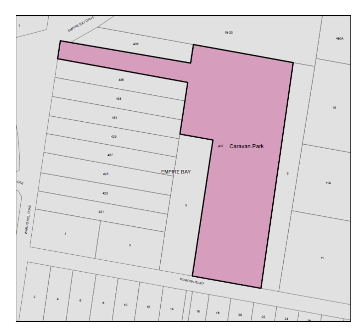
Figure 4 - Proposed APU under CCLEP

Most of the existing dwellings on the site are affected by flooding, however the use has been operating on this site for approximately 40 years. The caravan park has been used for long-term accommodation since, at least 2006, when consent was issued for this type of accommodation. It was not until the decision by the Court of Appeal in 2018 that the validity of this 2006 consent was questioned.