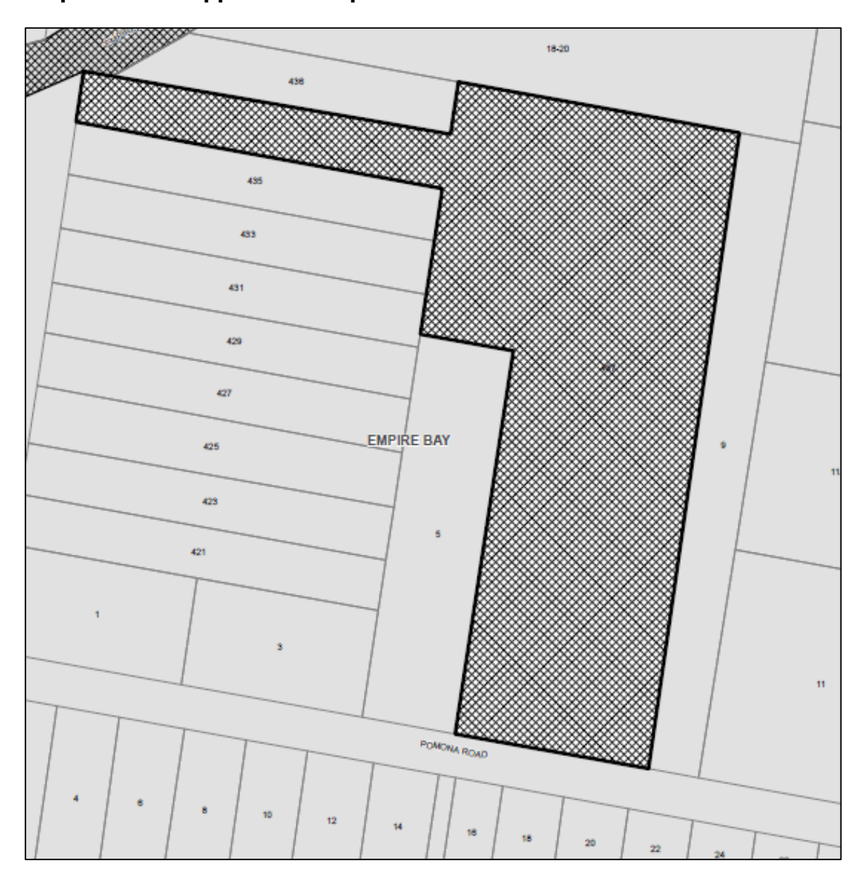
Figure 14 – Proposed Land Application Map under CCLEP