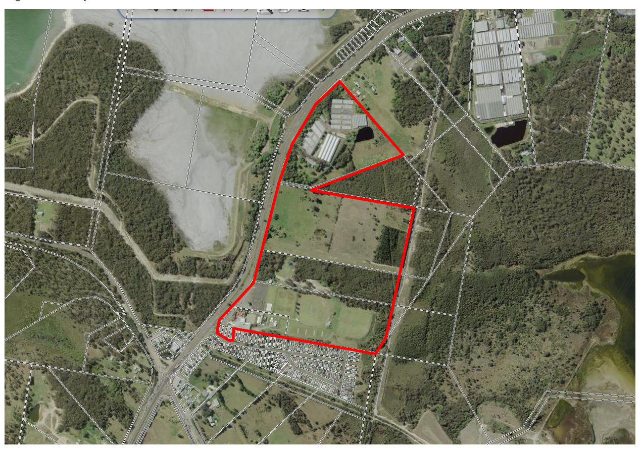
Figure 2 - Subject Site

Doyalson has a small population of 313 people. The closest major population centres to the site are Wyong (located 13km from the site) and Tuggerah (located 15.2km from the site). Wyong and Tuggerah are identified as strategic centres in the Central Coast Regional Plan 2036 and are targeted for population growth to grow social and economic benefits.