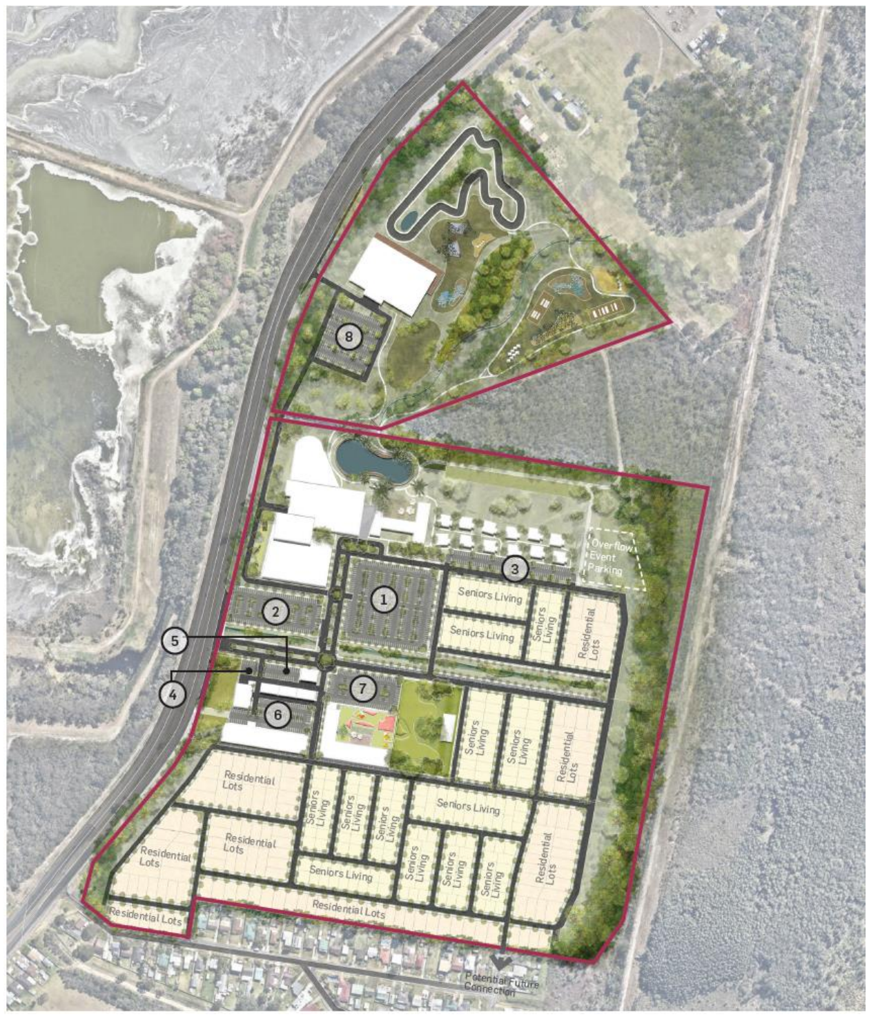
Figure 1 – Indicative Concept Plan